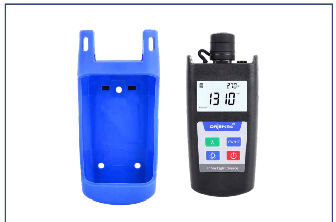
Detachable protective sleeve