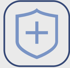
Silicone protective case