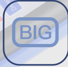
Super long standby