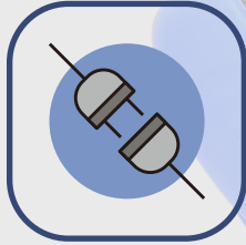
Plug and play